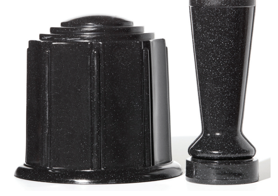
GRANGER FOREVERSAFE MEMORIAL URNS & VASES

GRANGER PLASTICS COMPANY 1600 M.A.D.E Industrial Drive Middletown OH 45044 513 424-1955