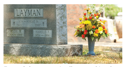
ForeverSafe vases are visually textured in colors that match popular metals and monument stone